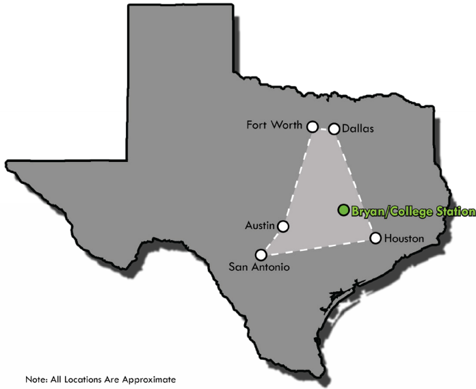
Note: All Locations Are Approximate

Located in the center of the Texas Triangle that is Dallas-Fort Worth, Houston, and San Antonio, The Bryan / College Station area is a high growth area, offering access to unmatched resources. The area provides access to a highly educated workforce with a unique work ethic, a low cost of doing business environment, and a quality of life that makes the region