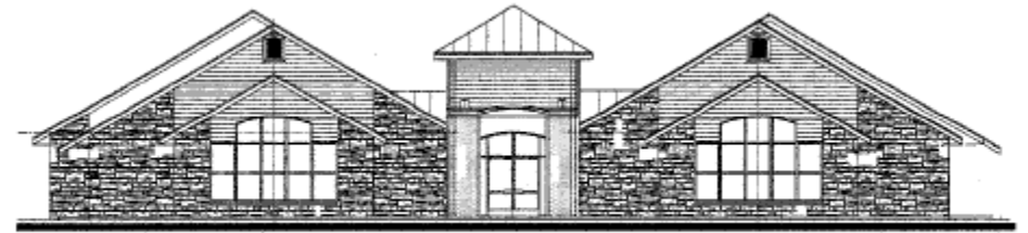
FRONT ELEVATION - BUILDING- " B "