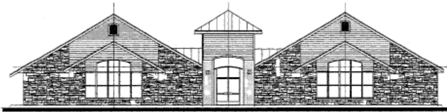
FRONT ELEVATION - BUILDING- " A "