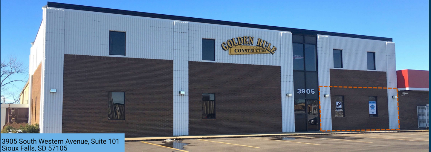
3905 South Western Avenue, Suite 101 Sioux Falls, SD 57105