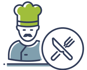
ROARING FORK RESTAURANT