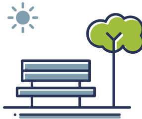
MULTIPLE OUTDOOR MEETING SPACES