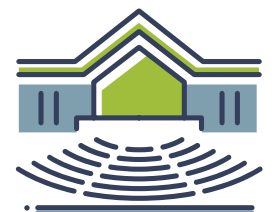
100 PERSON AUDITORIUM