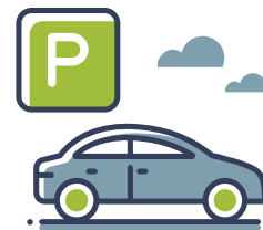
CONVENIENT SURFACE VISITOR PARKING