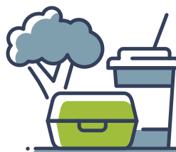
CITY MARKET DELI WITH OUTDOOR SEATING