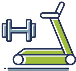
ON-SITE FITNESS CENTER