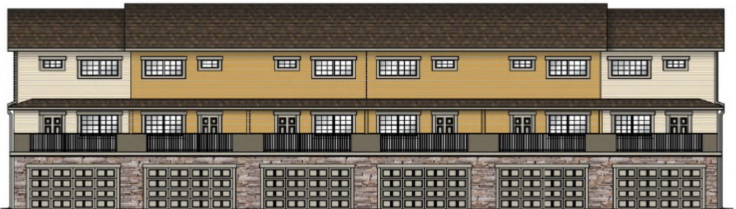
5-PLEX REAR ELEVATION SCALE: 1/8"=1'-0"

6320 Kearney Street Commerce City, CO 80223