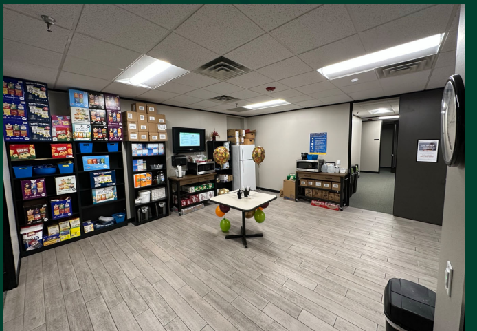
Overflow training room/break room space