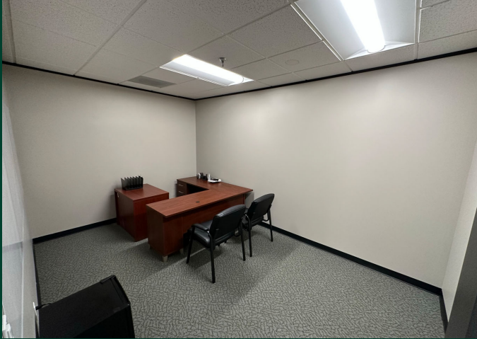
Typical interior office