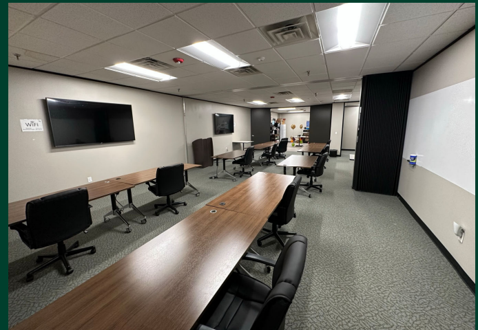
Training room with partitionable wall