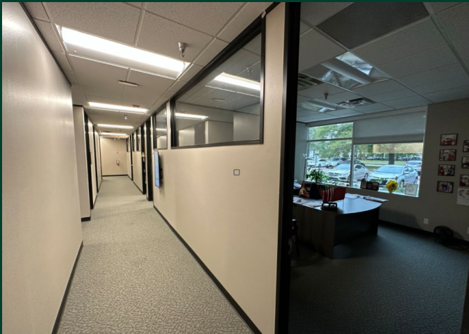
Transom windows throughout corridors