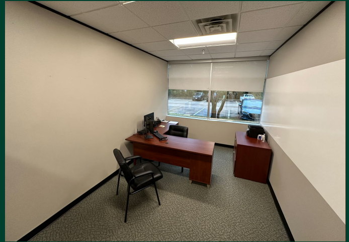
Typical perimeter office