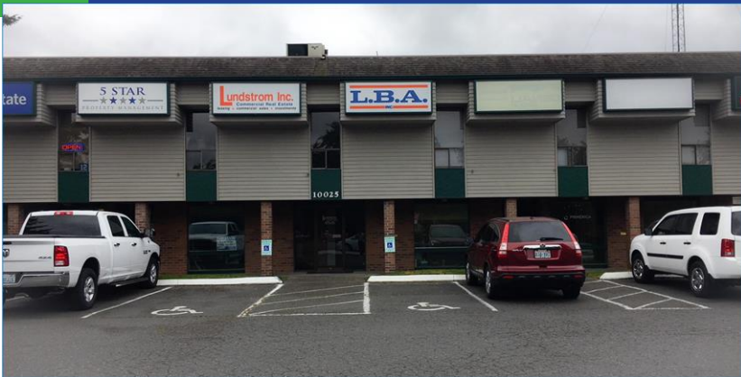
10025 LAKEWOOD DR SW, LAKEWOOD, WA