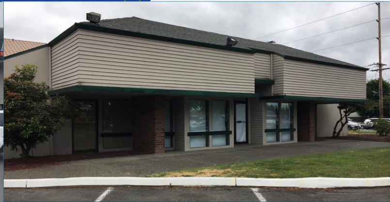
10015 LAKEWOOD DR SW, LAKEWOOD, WA