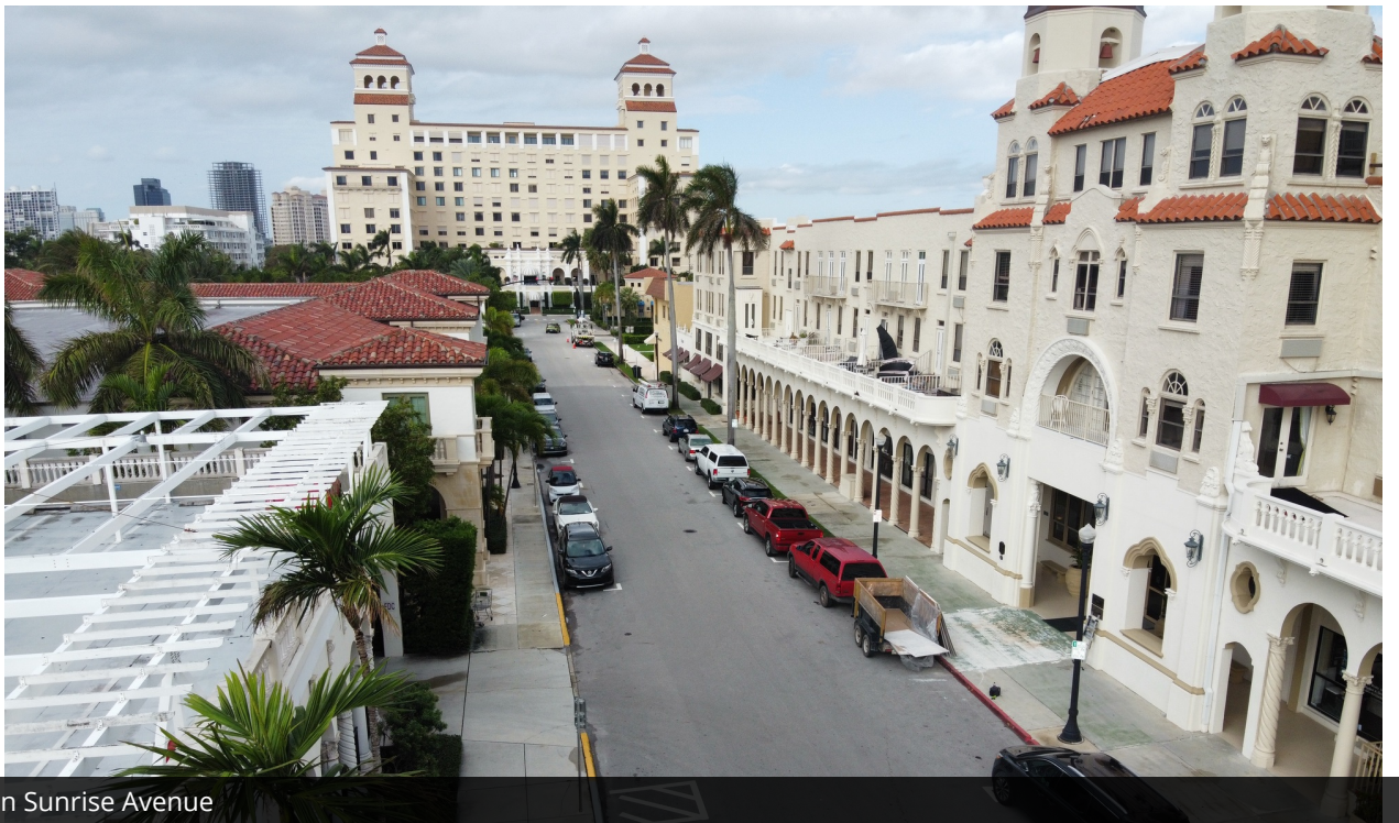
Looking West on Sunrise Avenue