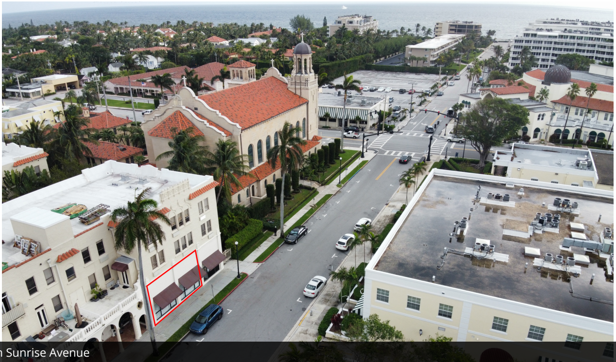
Looking East on Sunrise Avenue

235 Sunrise Avenue, Palm Beach, FL 33480