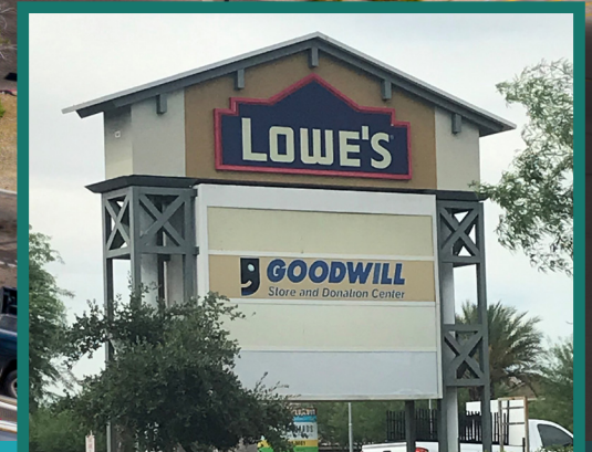
Street Signage on 19th Ave