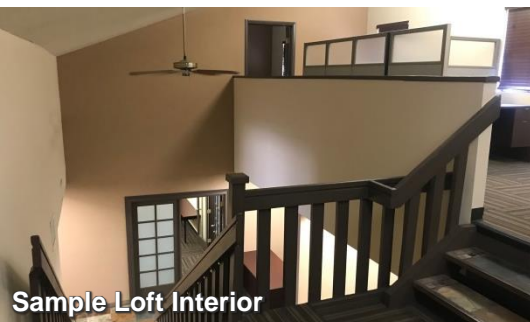
Sample Loft Interior