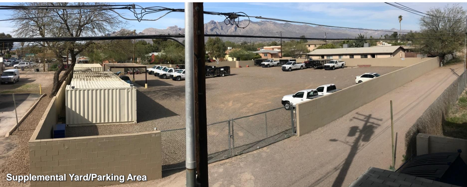
Supplemental Yard/Parking Area

Paul Hooker Principal, Industrial Properties +1 520 546 2704 phooker@picor.com