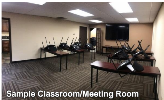
Sample Classroom/Meeting Room