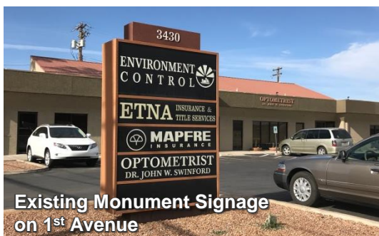
Existing Monument Signage on 1 st Avenue