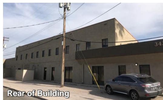
Rear of Building