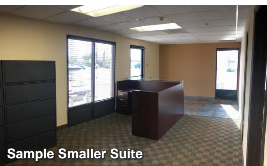
Sample Smaller Suite