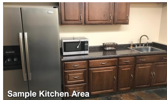
Sample Kitchen Area