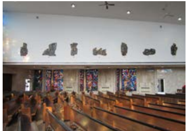
Side Sanctuary View