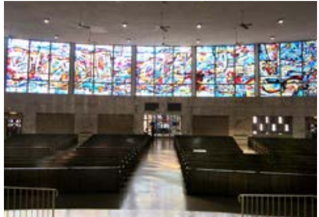
Sanctuary View from Stage