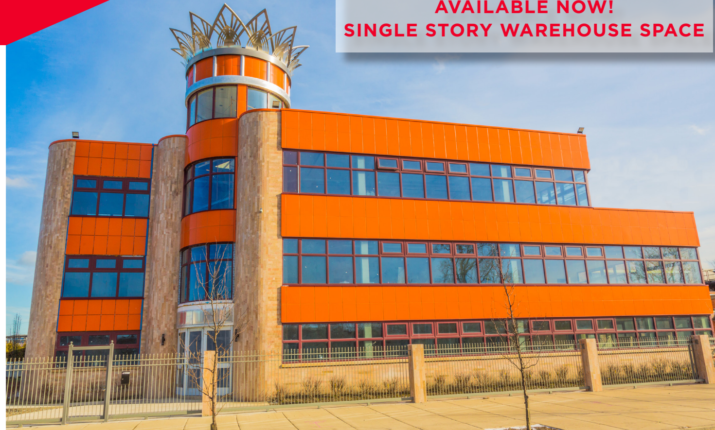
BRAND NEW OFFICE WITH TONS OF NATURAL LIGHT

One of a kind building with great clear height and strong loading