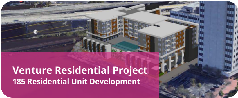
Venture Residential Project 185 Residential Unit Development