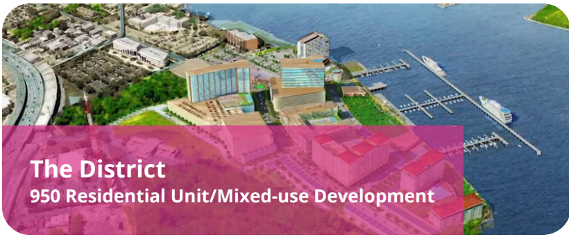
The District 950 Residential Unit/Mixed-use Development