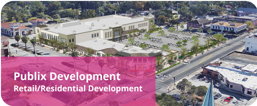
Publix Development Retail/Residential Development