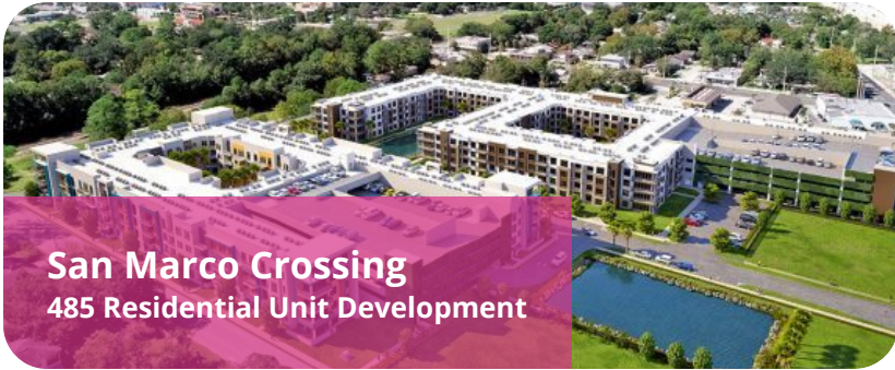
San Marco Crossing 485 Residential Unit Development