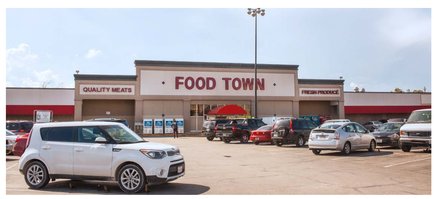
Channelview Grocery Store