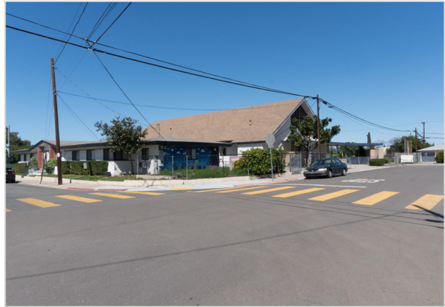
VIEW FROM INTERSECTION