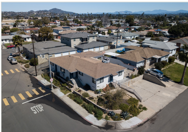
6126 ADELAIDE AVE