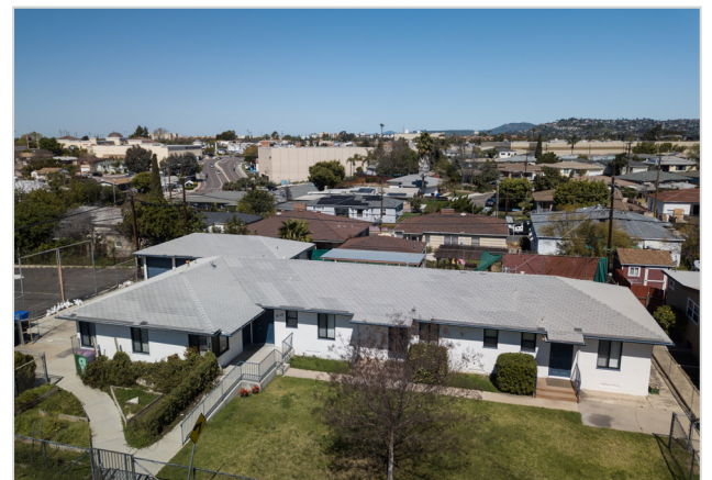
6112 LORCA AVE