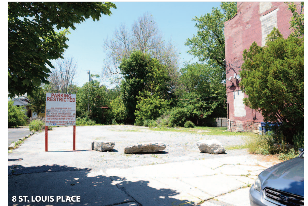
8 ST. LOUIS PLACE