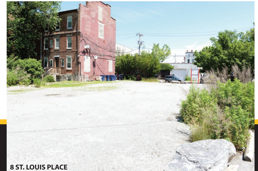
8 ST. LOUIS PLACE