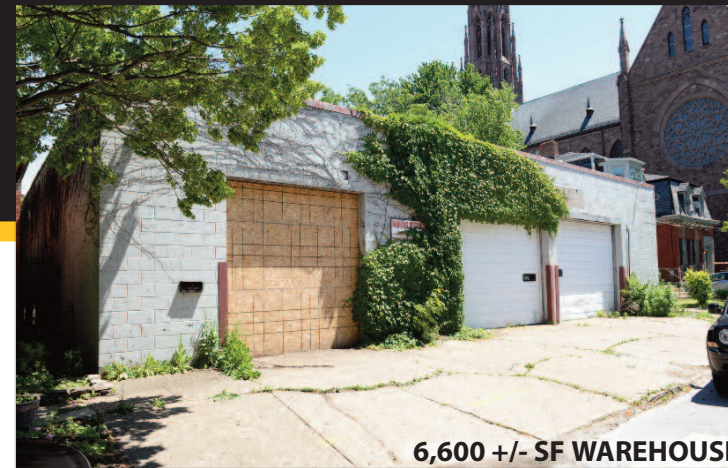
6,600 +/- SF WAREHOUSE