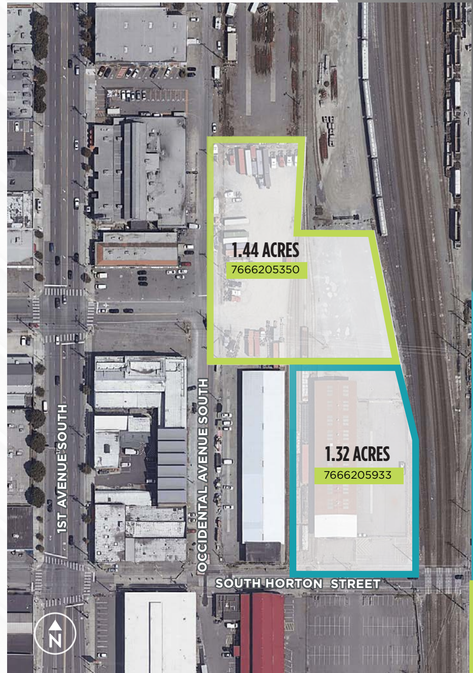
150 South Horton Street | Close in 2.76 Acre South Seattle Rail Served Site