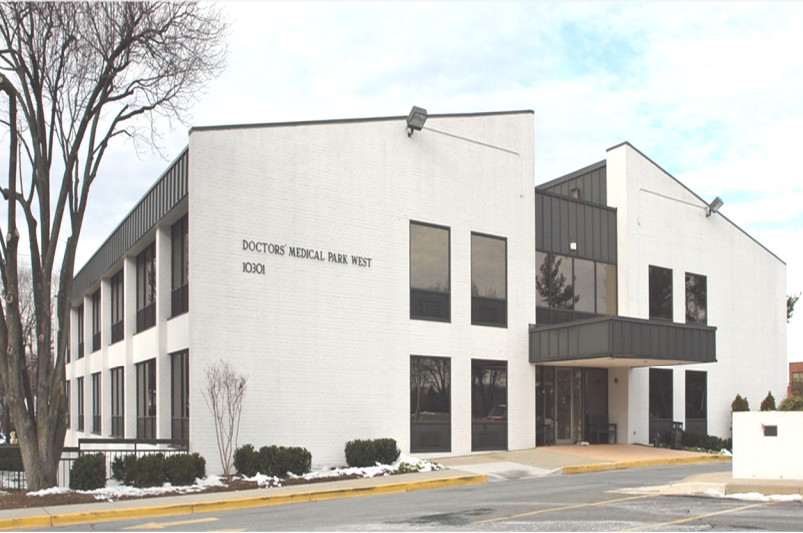
10301 GEORGIA AVENUE

Located on Georgia Avenue at the Capital Beltway