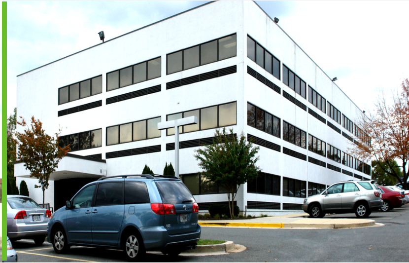
2101 MEDICAL PARK DRIVE

Situated on an attractive three-building medical campus