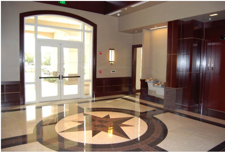
Beautiful 2 Story Lobby