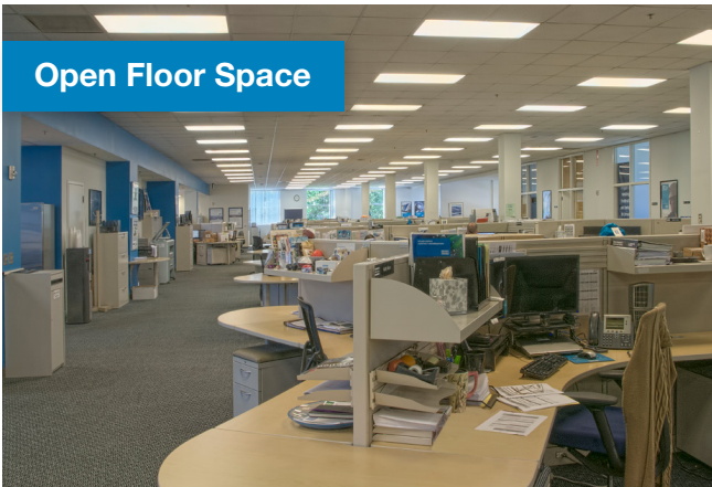
Open Floor Space