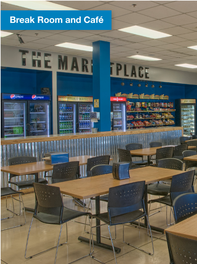
Break Room and Café