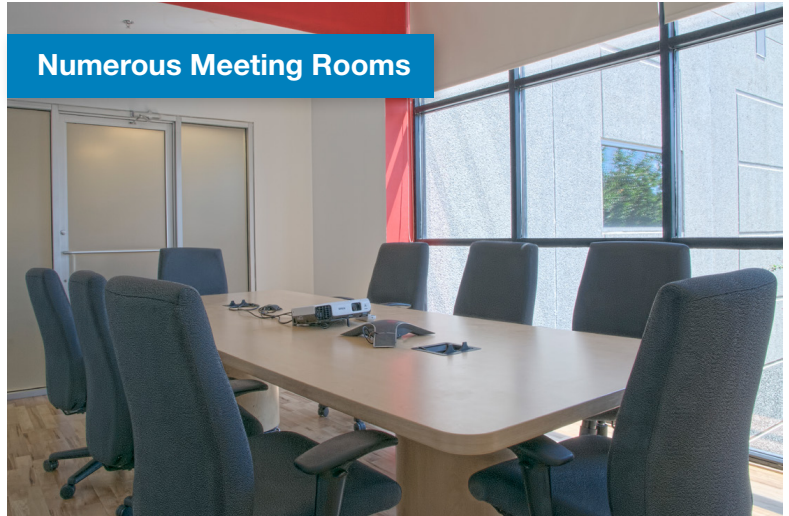
Numerous Meeting Rooms