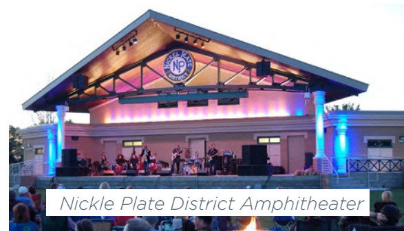
Nickle Plate District Amphitheater