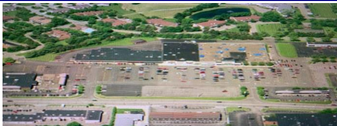
2865 Whipple. 2760 sqft