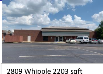
2809 Whipple 2203 sqft