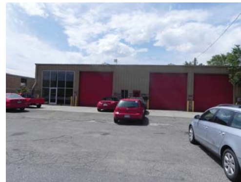
4211 Brighton Blvd.