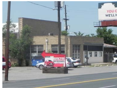
4221 Brighton Blvd.