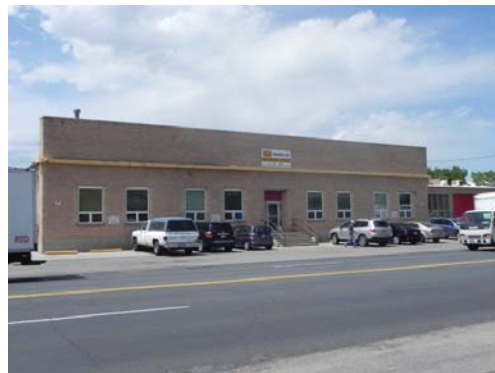
4201 Brighton Blvd.