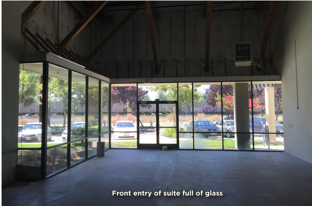
Front entry of suite full of glass