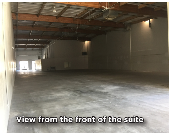
View from the front of the suite