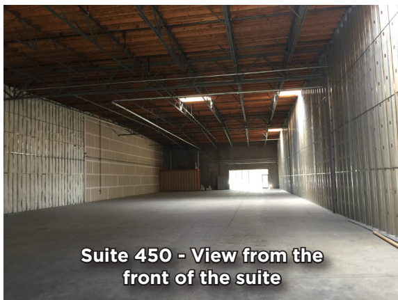
Suite 450 - View from the front of the suite