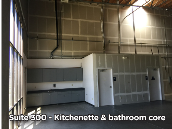
Suite 300 - Kitchenette & bathroom core