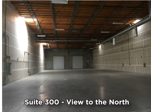
Suite 300 - View to the North