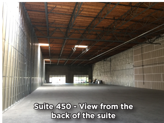
Suite 450 - View from the back of the suite

Jim Gray, CCIM Senior Director, LEED AP +1 916 617 4255 jim.gray@cushwake.com Lic.#00775072