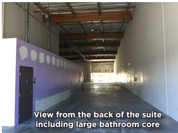
View from the back of the suite including large bathroom core