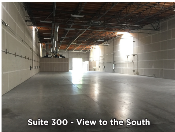
Suite 300 - View to the South