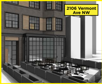
2106 Vermont Ave NW