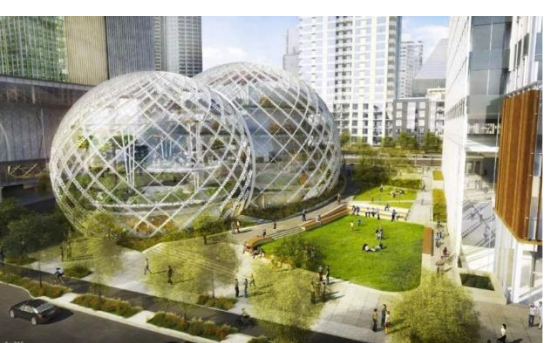
Possible Amazon headquarters here at The Gulch.