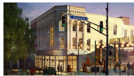
A Peachtree and Mitchell Street intersection rendering of Newport's 8 block redevelopment.