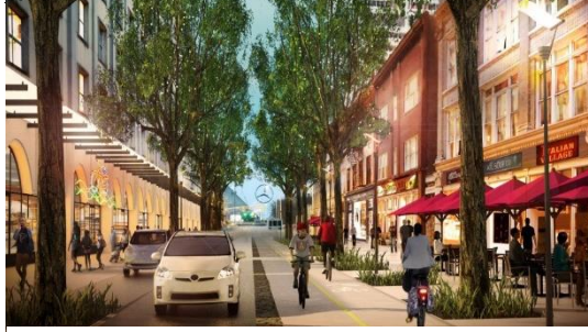
Mitchell St rendering, looking towards Mercedes-Benz Stadium.