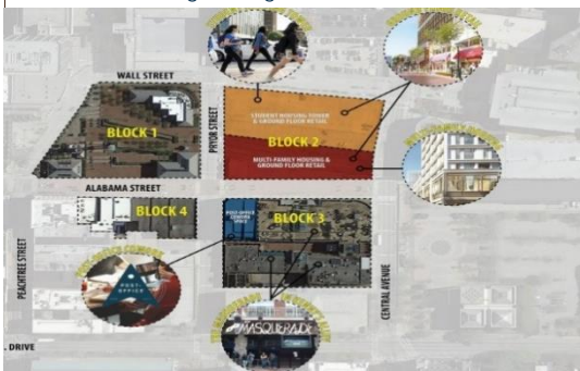
Underground Atlanta redevelopment map.