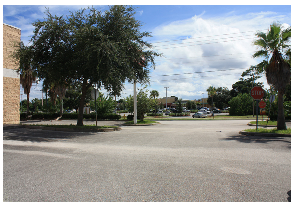
Parking Lot Entrance