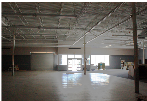
View from Warehouse Interior