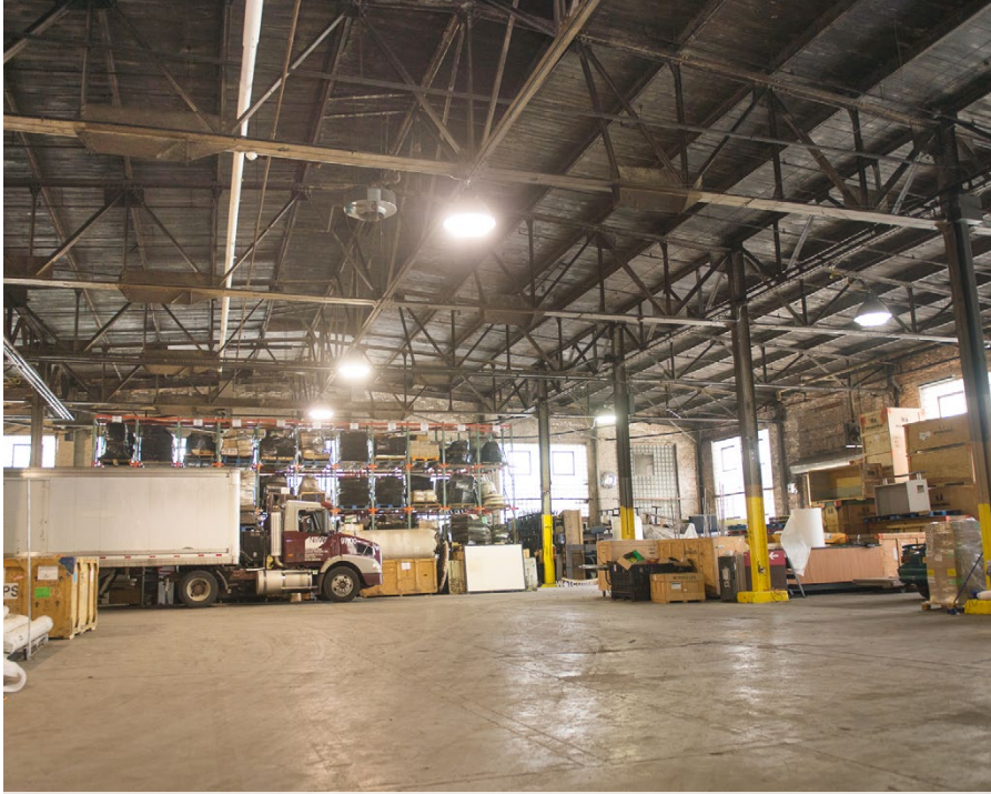
West Space Warehouse