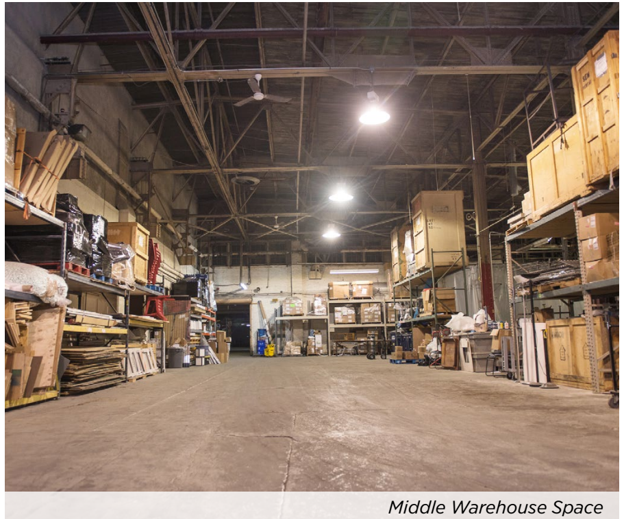
Middle Warehouse Space