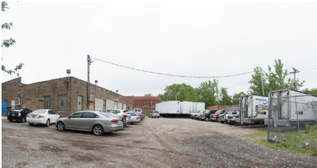
East Parking Lot