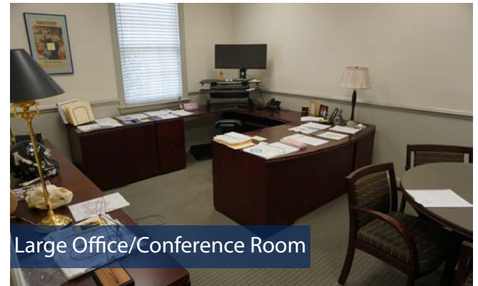
Large Office/Conference Room