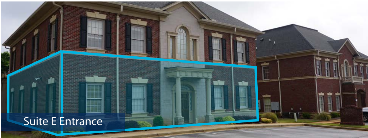
Suite E Entrance