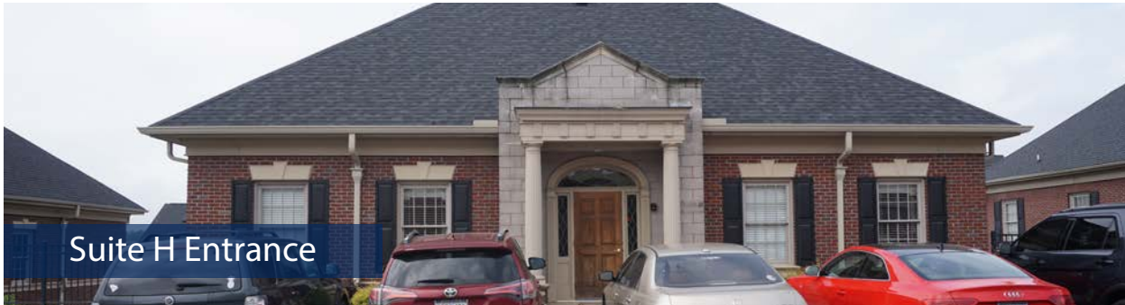
Suite H Entrance