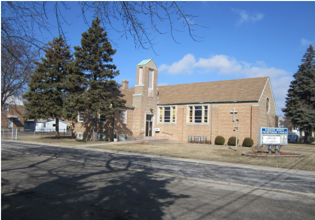
Side Exterior View