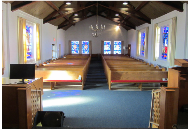
Sanctuary View from Stage