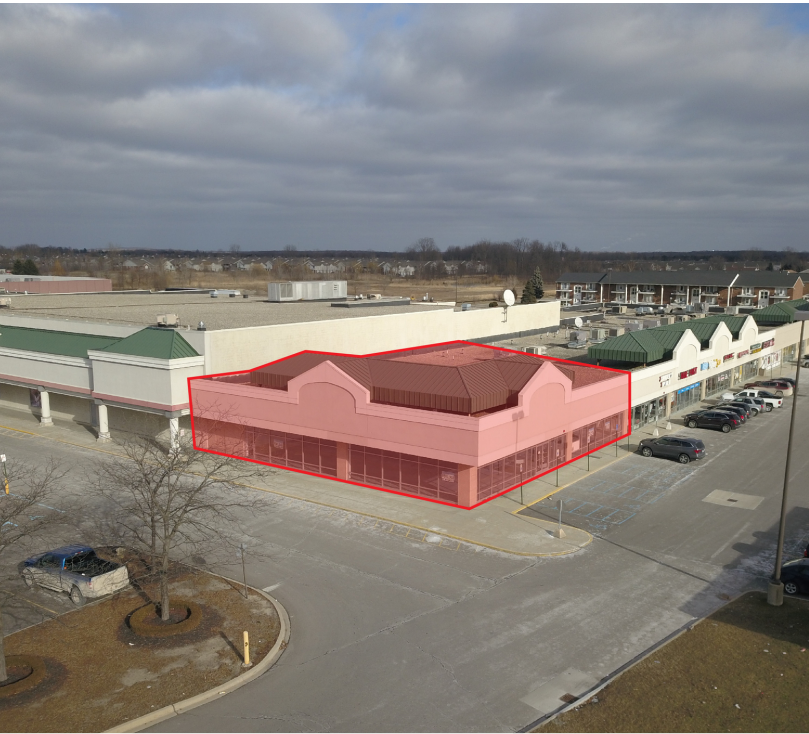
CORNER UNIT WITH SIGNAGE/VISIBILITY FROM TWO SIDES