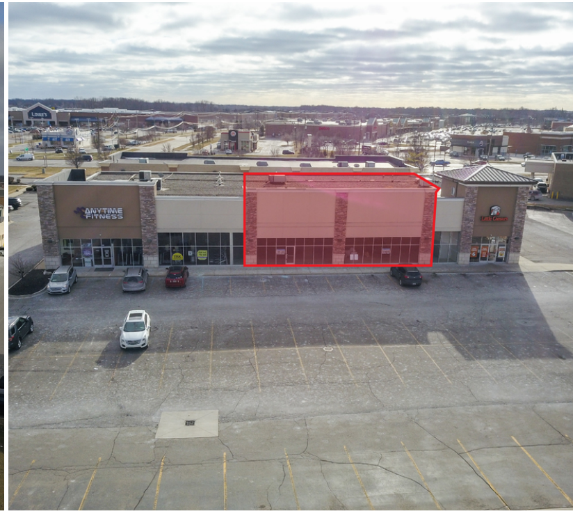
NEWLY CONSTRUCTED FACADE