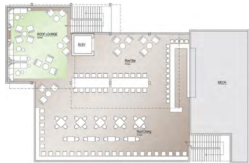
LEVEL 2 LAYOUT

± 3,800 SF Restaurant Building For Lease or Sale