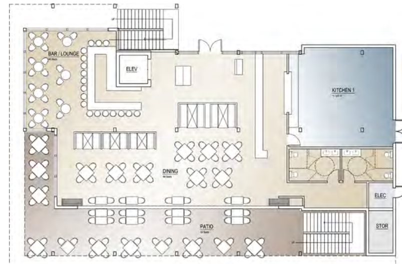
LEVEL 1 LAYOUT