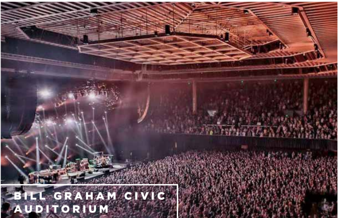
BILL GRAHAM CIVIC AUDITORIUM