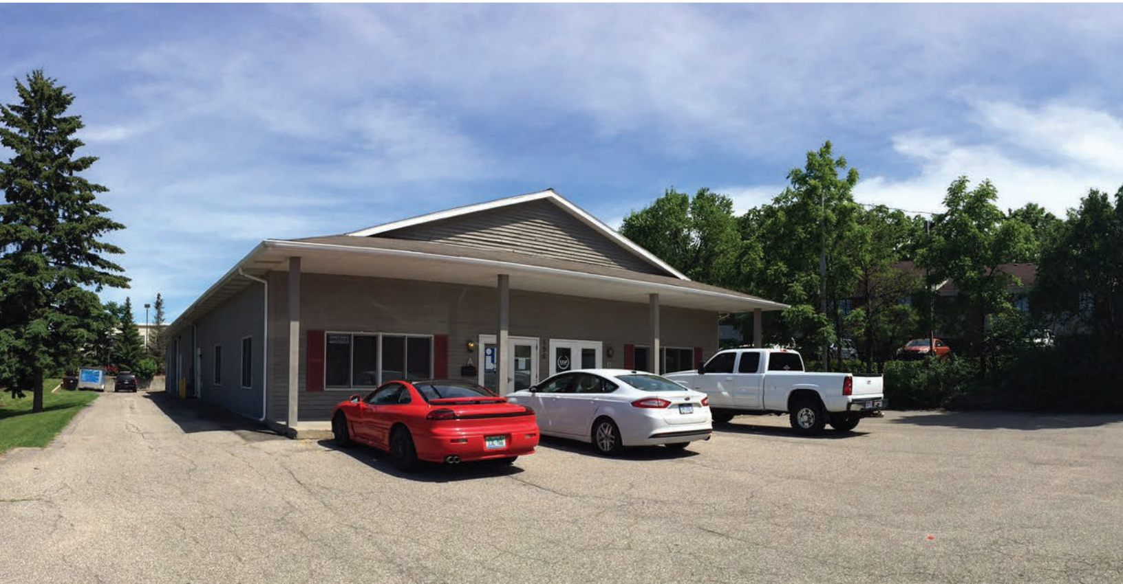
JUST OFF THE CORNER OF PLYMOUTH AND MICHIGAN STREET

APPROX. 850 RSF • MOVE-IN READY • $1,000/MO MOD GROSS • FOR LEASE