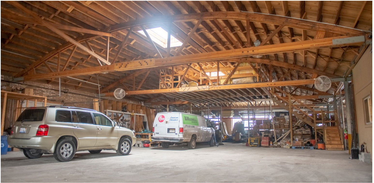
Unit N Warehouse