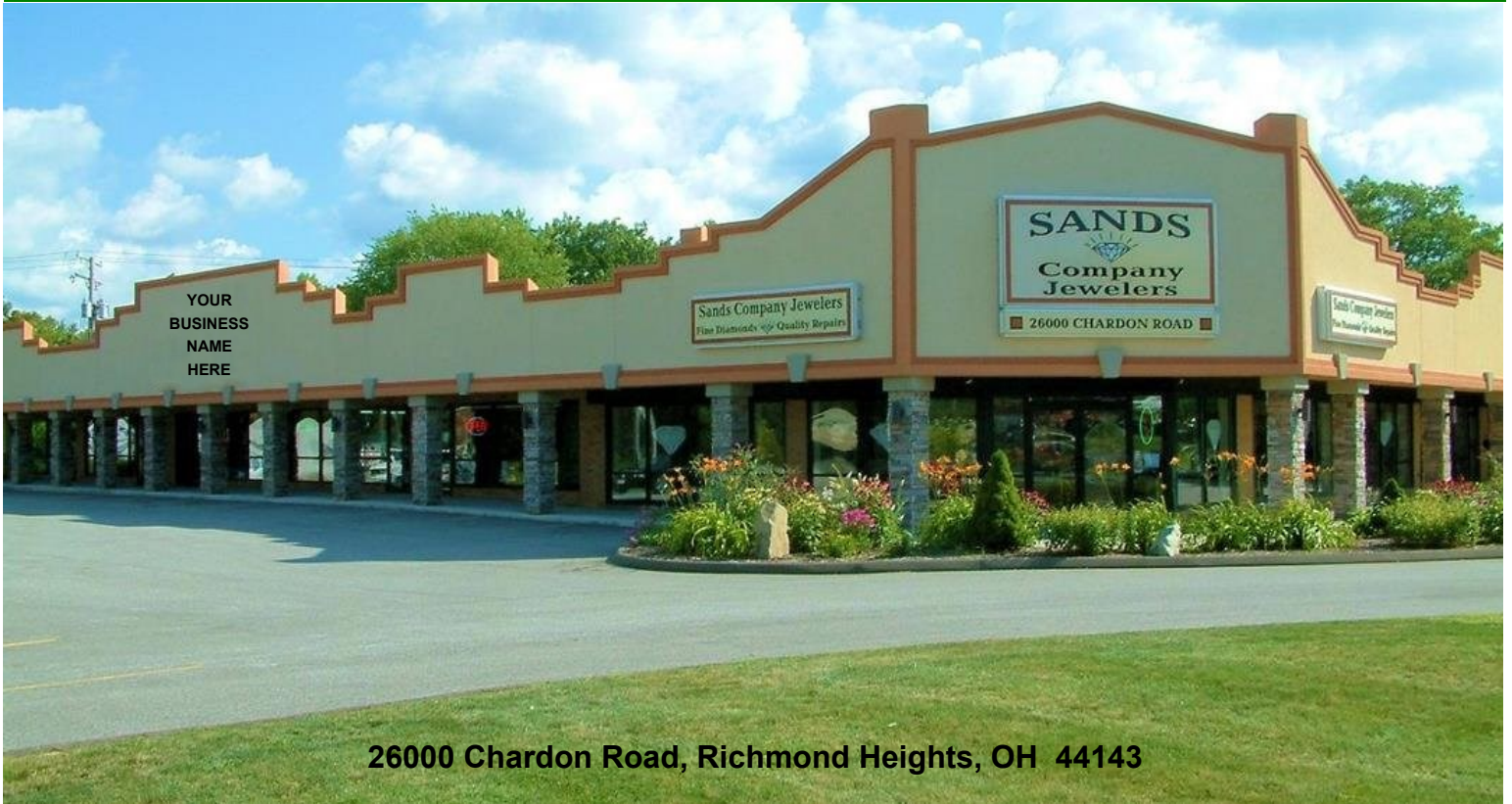
26000 Chardon Road, Richmond Heights, OH 44143

Richmond Heights, Ohio 44143 (Cuyahoga County)