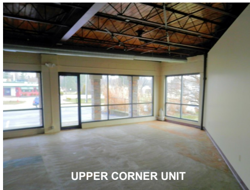
UPPER CORNER UNIT