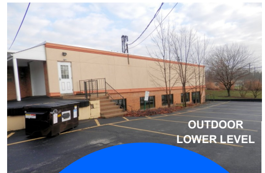
OUTDOOR LOWER LEVEL