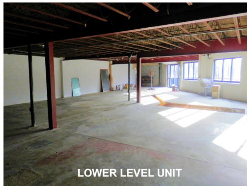
LOWER LEVEL UNIT