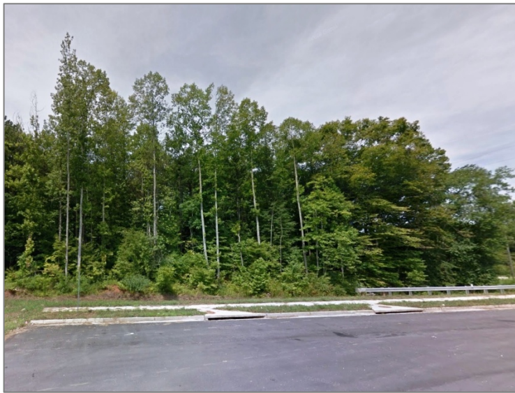
View From Lee Road