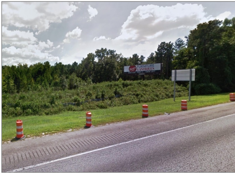
View From I-20