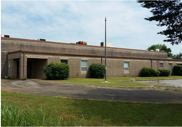
Side View of Property