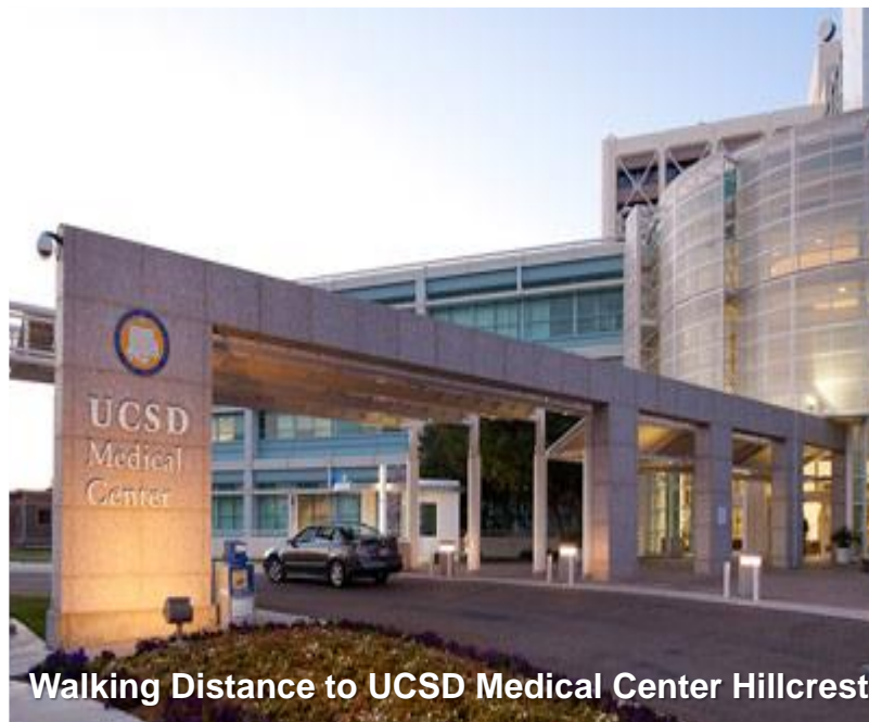
Walking Distance to UCSD Medical Center Hillcrest