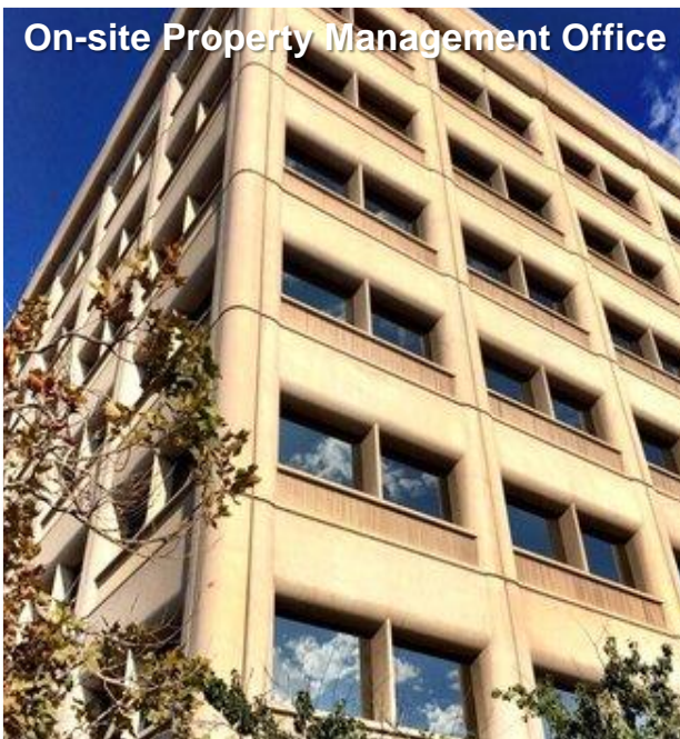
On-site Property Management Office