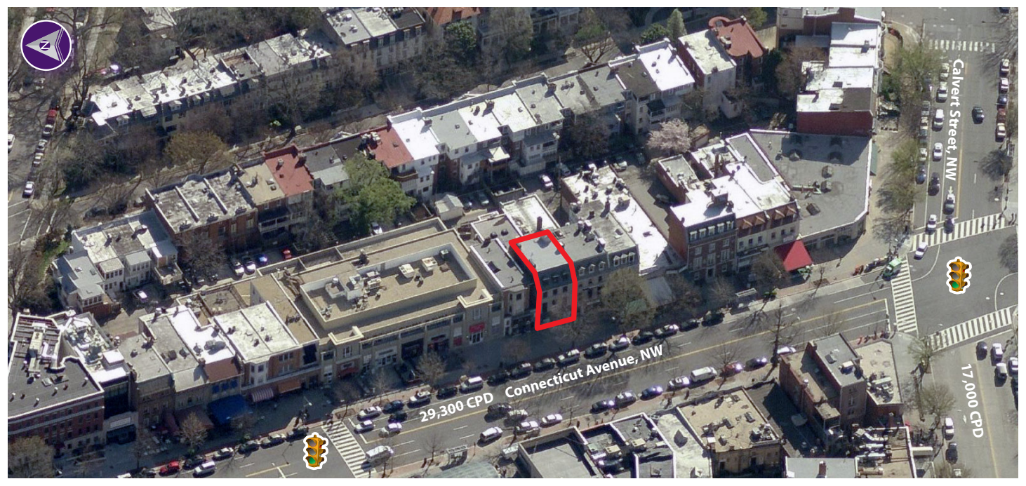
Information herein has been obtained from sources believed to be reliable. While we do not doubt its accuracy, we have not verified it and make no guarantee, warranty or representation about it. Independent confirmation of its accuracy and completeness is your responsibility. H&R Retail, Inc.