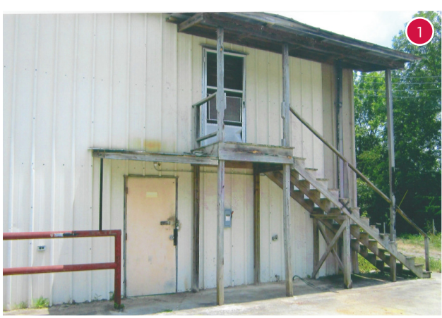
Rear view of large warehouse