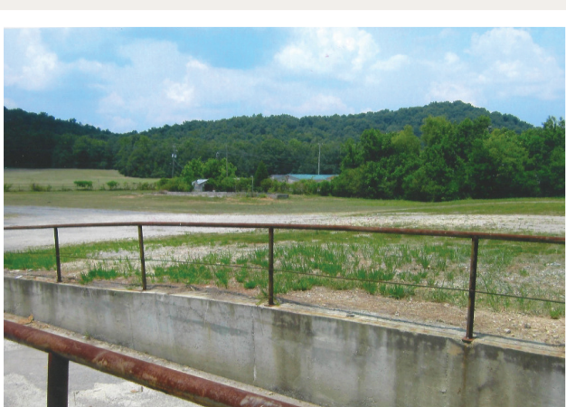
View of Hwy 75 from front loading dock