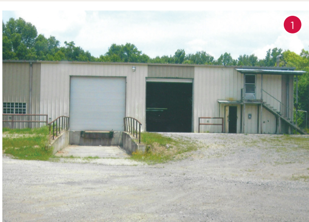
Large warehouse and front loading docks