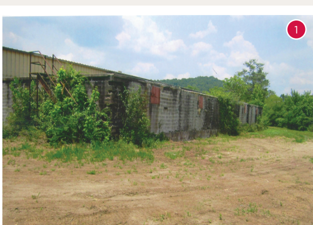
Rear view of large warehouse