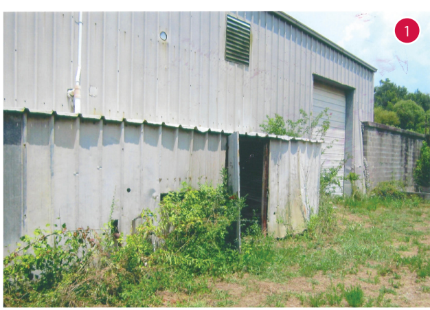
Rear view of large warehouse