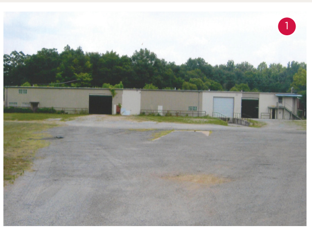
View of large warehouse from road