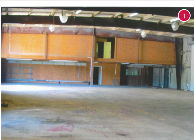
Inside of large warehouse