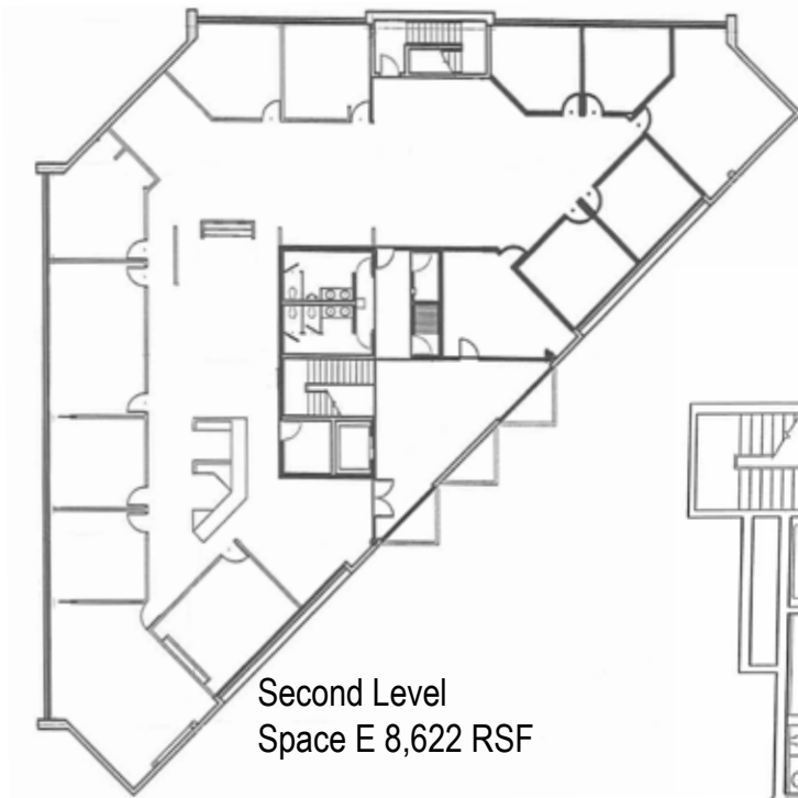
Second Level Space E 8,622 RSF