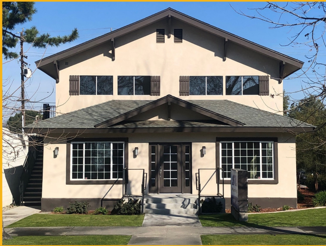
2324 Truxtun Avenue