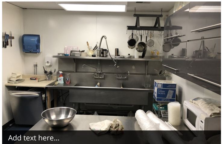
Add text here...