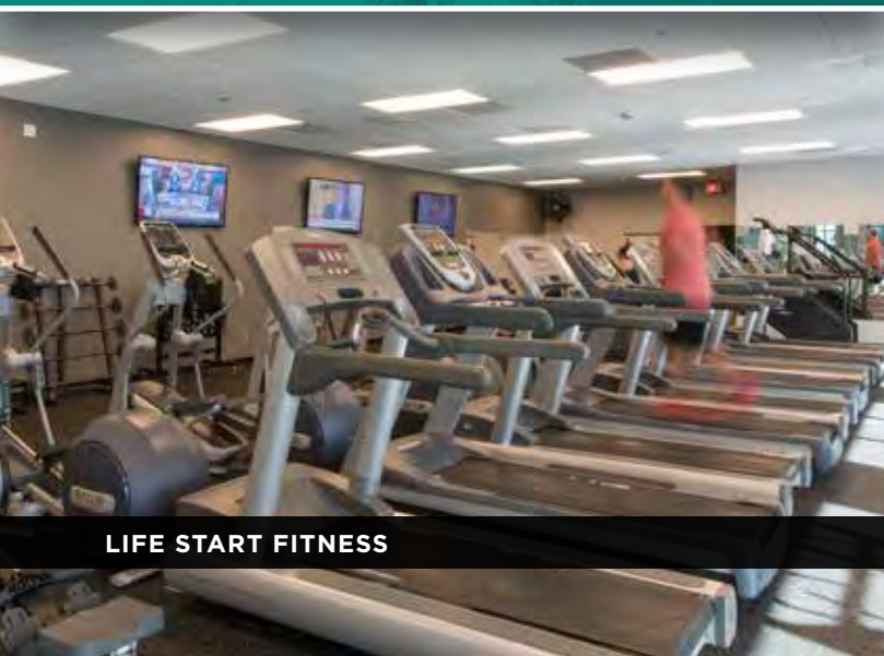
LIFE START FITNESS