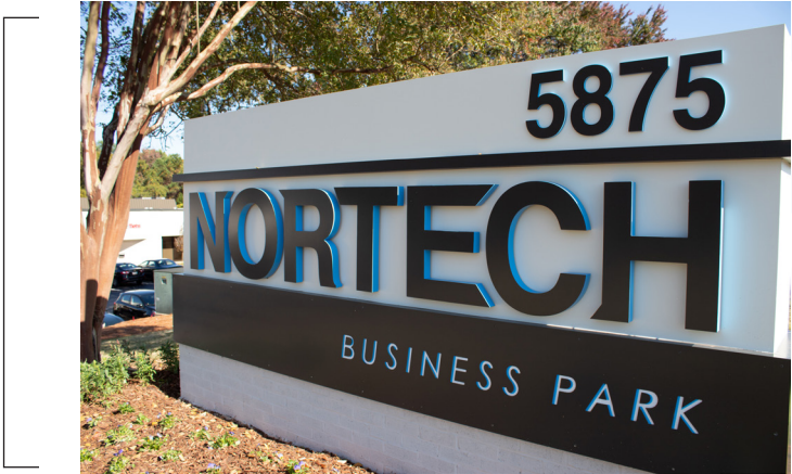
UPDATED MONUMENT SIGN