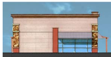
3 NORTH ELEVATION