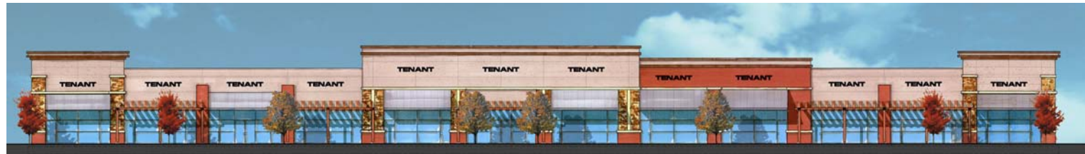
1 WEST ELEVATION