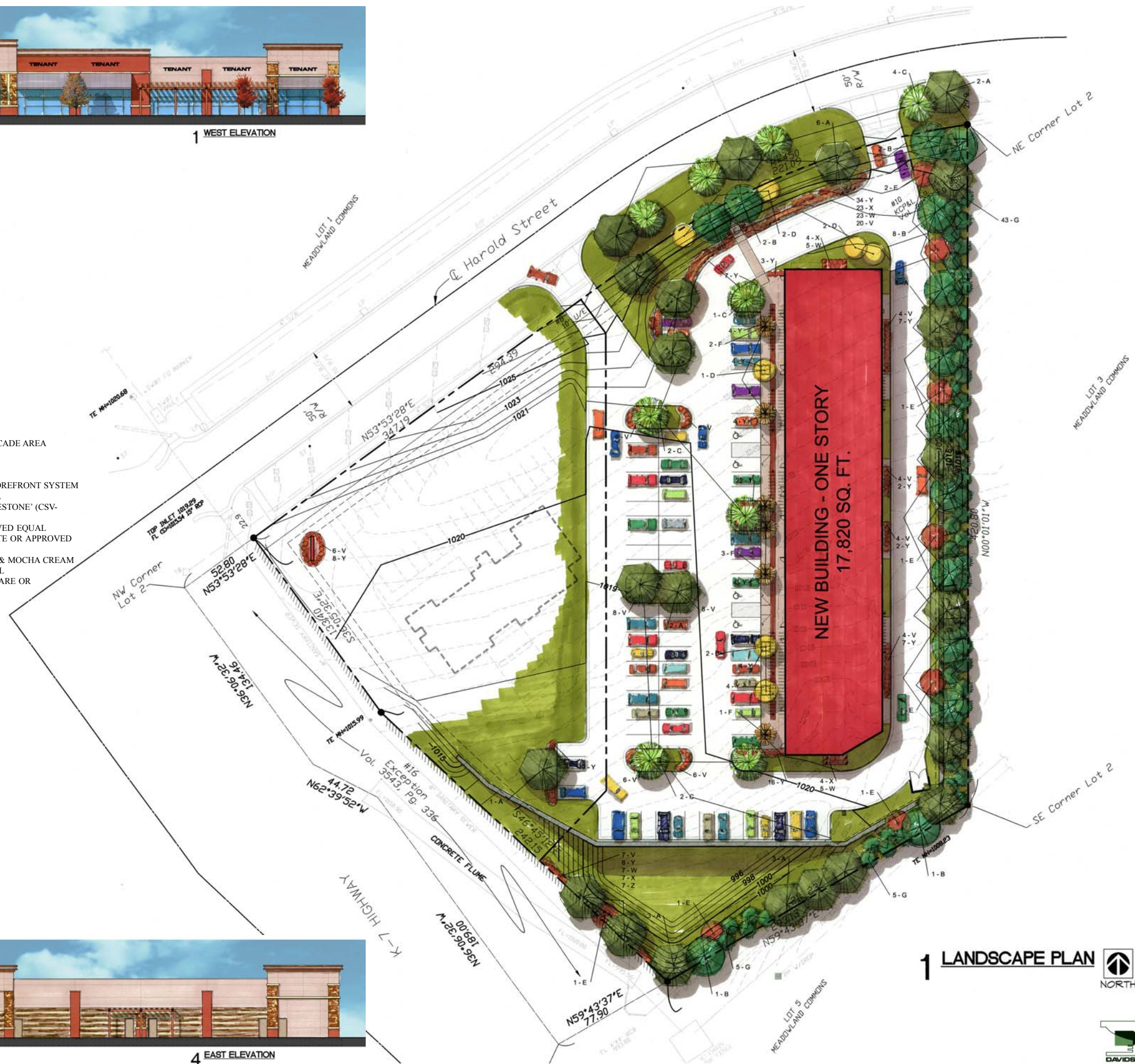
1 LANDSCAPE PLAN

MATERIAL COVERAGE ON ENTIRE BUILDING: GLASS: 26% OF TOTAL FACADE AREA BRICK / CAST STONE / CULTURED STONE: 24% OF TOTAL FACADE AREA ROUGH HEWN CMU: 38% OF TOTAL FACADE AREA STUCCO: 38% OF TOTAL FACADE AREA SPECIFIC BUILDING MATERIALS: GLASS: CLEAR GLASS IN CLEAR ANODIZED ALUMINUM STOREFRONT SYSTEM BRICK: SOUX CITY BRICK 'EBONITE' OR APPROVED EQUAL APPLIED STONE: CULTURED STONE 'SHALE CONTRY LEDGESTONE' (CSV-20044) DRYSTACK OR APPROVED EQUAL CAST STONE: CONTINENTAL CAST STONE #1102 OR APPROVED EQUAL ROUGH HEWN CMU: OLDCASTLE CARMEL & KANSAS WHITE OR APPROVED EQUAL STUCCO: STO INDIANA LIMESTONE 10622 FOR MAIN BLDG. & MOCHA CREAM 1015 FOR CORNICE IN MEDIUM FINISH OR APPROVED EQUAL PERGOLA: STAINED CEDAR & BLACK SIMPSON TIE HARDWARE OR APPROVED EQUAL CANOPY: BLACK CANVAS W/ RETURNS TO BLDG.