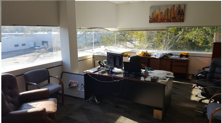
Information deemed reliable but not guaranteed and offerings subject to errors, omissions, change of price or withdrawal without notice.