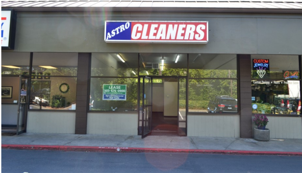
Suite 8112—1,000 SF