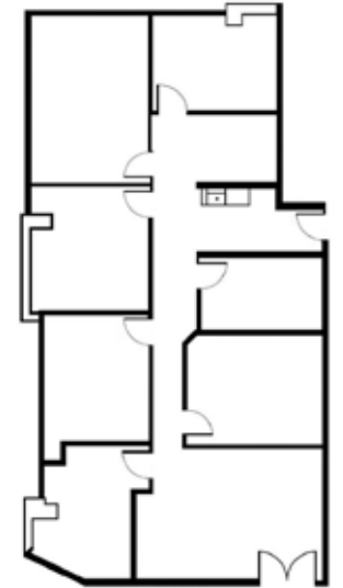
Suite 220: ±2,275 RSF